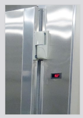
Temperature display on he exit side of the trolleys