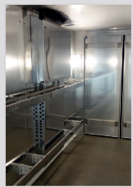
Technical service duct fitted vertically for easy maintenance and cleaning