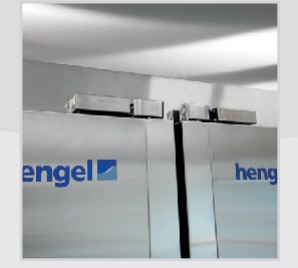
Automatic closing door with hydraulic actuator placed outside to avoid any risk of